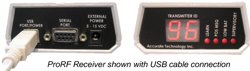
ProRF Receiver shown with USB cable connection

Note: When connecting the ProRF Receiver to the PC via a USB cable, the Receiver is powered from the PC. No additional power is required.