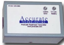
ProRF Encoder Transmitter

This manual DOES NOT include Set-up and Operation information for either of the Transmitters pictured above.